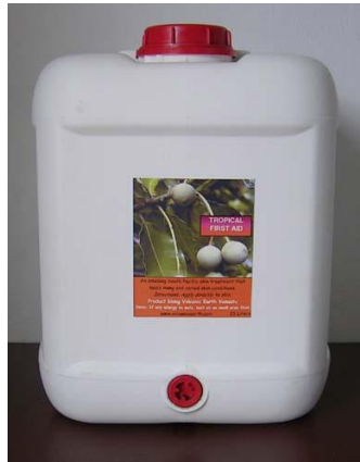
20 Liters of 100% Tamanu Oil

The oil is then extracted by cold-pressing and filtration. It takes an awful lot of nuts to produce a small quantity of oil – in fact, it takes around four trees to produce approximately 20 Liters of “pure” Tamanu Oil, depending on the size and yield of the trees!