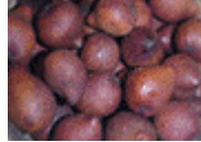
Dried Tamanu Nuts

The fruit is allowed to fall naturally from the tree and the pale-colored nut kernels are then laid out on racks to dry (for 1-2 months). During this process, these kernels turn a brownish-red color and release a strong, rich oil.